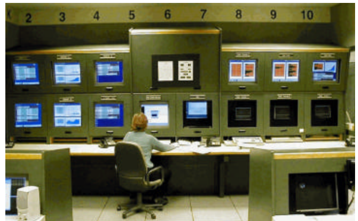
Distributed communication facilities operate 24 / 7 / 365